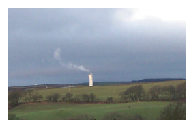
The incinerator in action - almost a rarity in early 2008.

The full report is available at www.sita.co.im