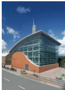
Pulrose Power Station Is there a 'greener' way of meeting our energy needs?

Which? is dealing with more green issues these days. Pop into your local Library to catch up with the latest report.