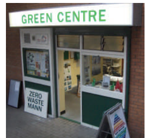
The Green Centre Market Street Douglas

When you have finished with your copy please either pop it into a paper recycling bank or pass it on to a friend, family member or work colleague.