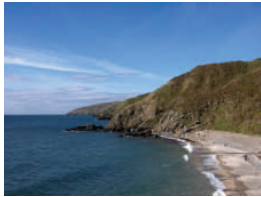
Coastal waters and shorelines threatened by off-shore development?

The announcement, in August 2007, by the DTI, that prospecting licenses were being issued for marine aggregate dredging, off the Island's north-east coast, prompted the formation of a new 'umbrella' organization for concerned marine interest groups.