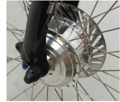
A 250 watt front hub motor