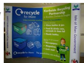
'Recycle for Mann' The possibilities are endless

A series of public road-shows are planned during October, following the media launch, so an opportunity to view the vehicles will be provided in advance of the service becoming operational.