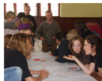
Is Transition the way forward?

The key to successfully altering your own thinking and behaviour regarding climate change, natural environment and social-wellbeing is to know which stage of change you are in and then to use appropriate change mechanism with each stage. But until you have been through this process yourself you can't appreciate how difficult it is and start helping other people to change.