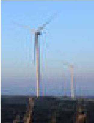
Will your wind turbine enable you to cut the tie to the MEA?

Electricity cannot be stored, at least not as electricity. So the first choice is whether to store excess generation or use it all immediately its generated, perhaps as water or space heating.