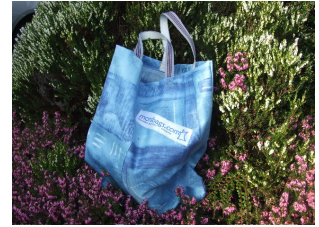
Lets make 2010 the year of the Morsbag

New, gorgeous, great quality and totally ethical dark blue morsbags t-shirts . They've proved highly popular although we still have plenty left in stock, so please feel free to order for all your morsbagging needs next year! http://www.morsbags.com/stuff/stuff.html