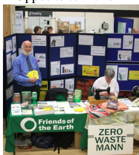
Would you like to sign my petition?

Opposite to the IoM FoE stand was the Centrica marine windfarm display who were answering all kinds of Q's regarding one of the most abundant forms of renewable power around the B Isles after all it has been proven that we are the windiest place in Europe - http://www.offshorewind.biz/2010/03/10/isle-of-man-offshore-wind-farm-plans/