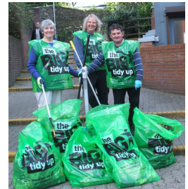
The Green Centre Crew show how it's done

Footnote: ZWM would welcome individuals or groups seeking further advice to contact them and are also able to supply litter pickers.