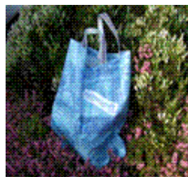
Why not take a reusable bag when you go shopping

At that point you either give up and accept the plastic bag