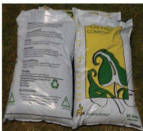
Compost ready for your garden; available in handy sized bags or in bulk sacks

The good news is that modern real nappies are easy to use and easy to wash.